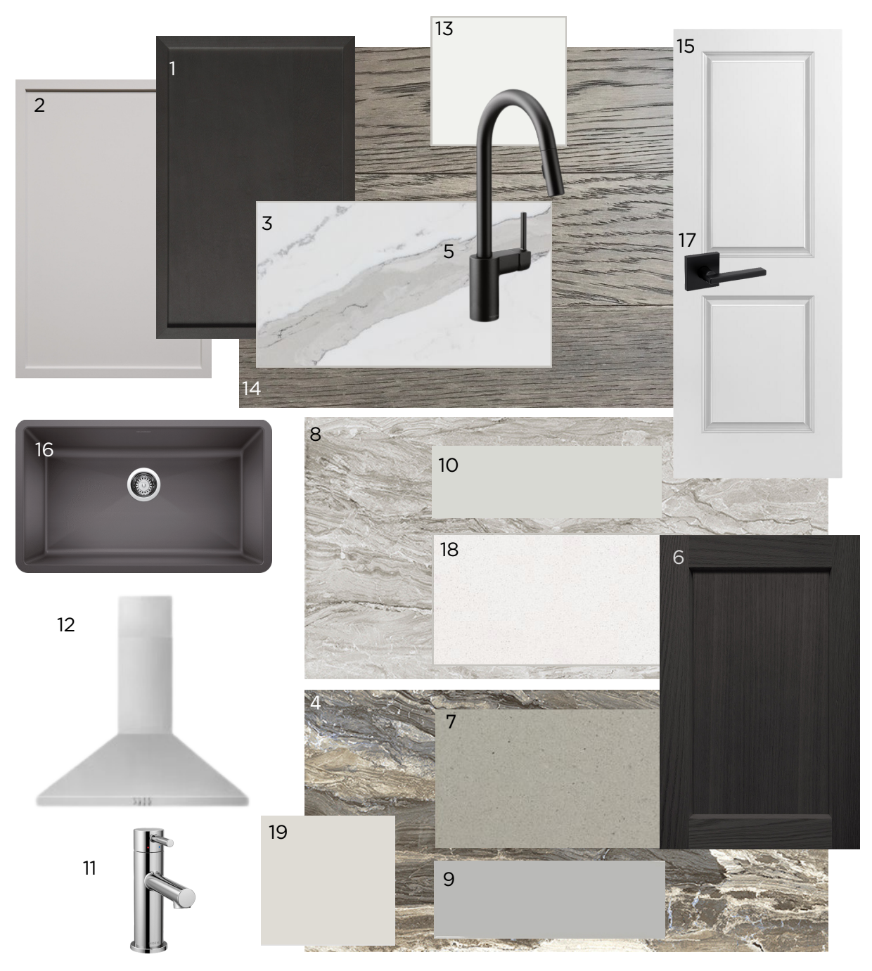
Kitchen Island & Base Cabinet 2. Kitchen Upper & Pantry Cabinet 3. Kitchen Countertop & Backsplash 4. Primary Ensuite Floor Tile 5. Kitchen Faucet 6.Primary, Main Bath & Powder Room Cabinet 7. Primary Ensuite Countertop 8. Main Bath, Powder Room & Foyer Tile 9. Primary Ensuite Wall Tile 10. Main Bath Wall Tile 11. Bathroom Faucet 12. 30" Chimney Hood Fan 13. Interior Paint 14. Flooring 15. Interior door 16. Undermount Single Bowl Undermount Sink 17. Interior Door Hardware 18. Main Bath & Powder Room Countertop 19. Primary Bed & Ensuite Paint

Mayfair - 18' 3-Storey Townhome Lot 38 - 1,740 SQ.FT.